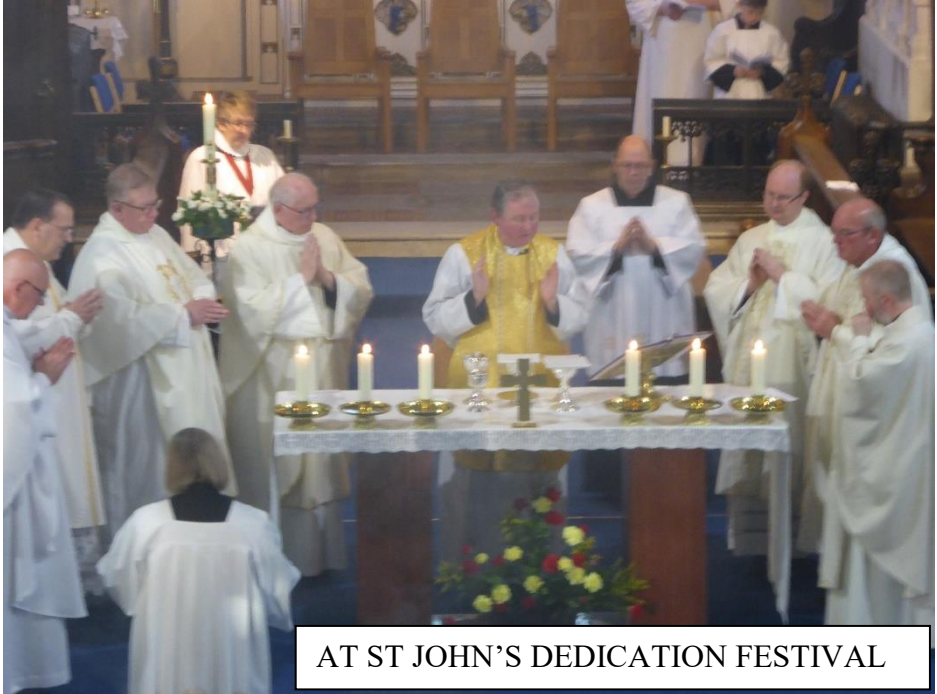
AT ST JOHN'S DEDICATION FESTIVAL

Monasteries were among the most powerful economic, educational and social welfare institutions in England until Henry V111 destroyed them and seized their wealth. (Daily Mail)